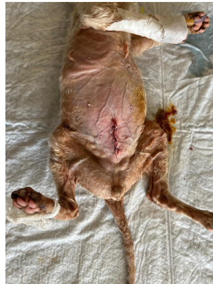
Fig. 3: Postoperative appearance of the cat following colopecty showing normal perineal anatomy and absence of rectal prolapse during follow-up

exhibited recurrence of rectal prolapse. No postoperative complications such as wound infection, dehiscence, constipation, or tenesmus were observed.