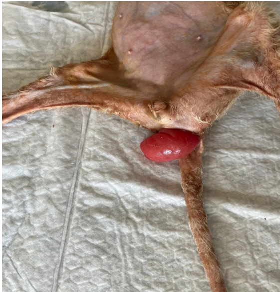
Fig. 1: Recurrent rectal prolapse.