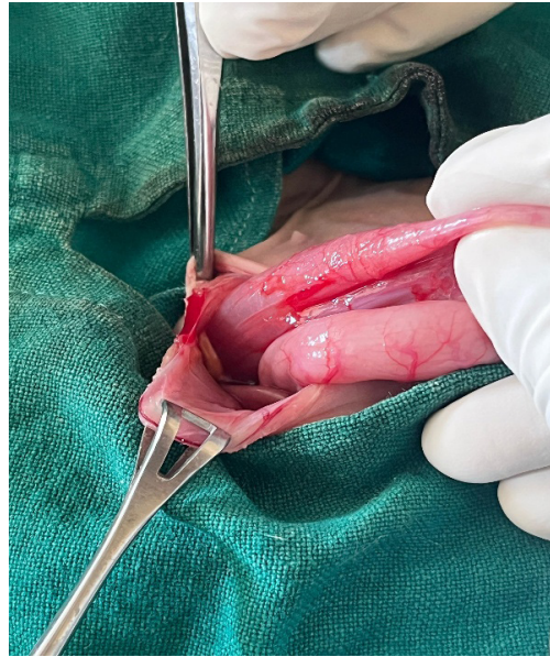
Fig. 2A: Ventral midline celiotomy and exteriorization of the descending colon;