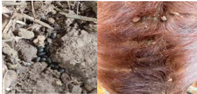
Fig. 2: (A) Ticks in cracks, (B) Ticks from shoulder region