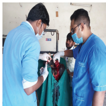
Fig. 1: Presence of two masses at the perineal region

Submitted: 12/07/2023 Accepted: 26/08/2023 Published: 10/09/2023