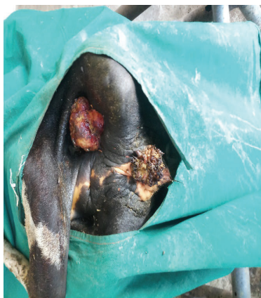
Fig. 3: Skin suture after mass removal