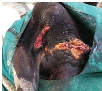
Fig. 2: Surgical management of tumor